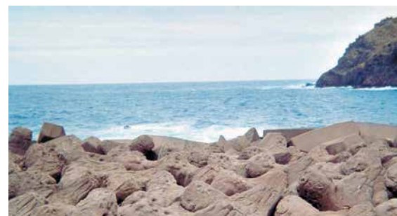
ECOPODE™ placed over a crest