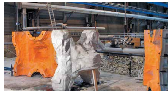
ECOPODE™ unit limestone appearance

NB: higher rates can be obtained using hydraulic placing equipment with small size units.