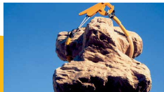
Handling with sling